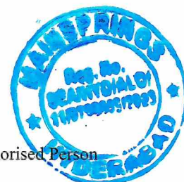
Signature of the Authorised Person

On behalf of Main Springs #203, Surabhi Lotus, 2nd Floor, Near Image Hospital, Ameerpet, Hyderabad, Telangana-500073